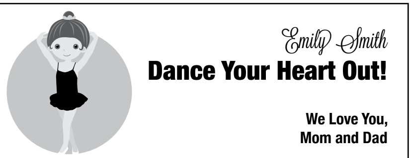
Sample Personal Ad - Actual Size